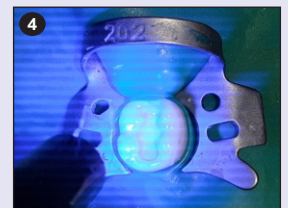
Light cure for 20 sec.