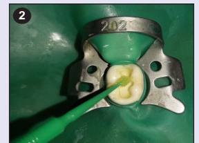
Apply & then rub the preparation for 10 to 15 sec per coat. Do not light cure between coats.