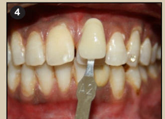
Shade change after 20 minutes of bleaching