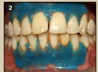
Application of Liquid dam. Light cure for 20 seconds