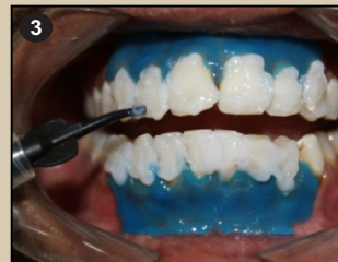
Application of Bleaching agent