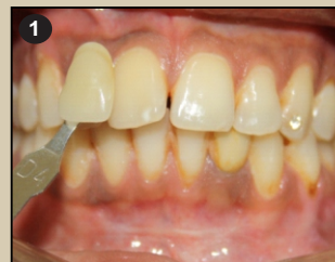
Initial shade determination