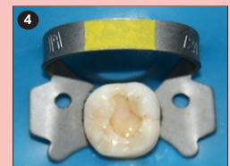
Completed pulp capping