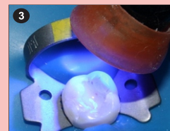
Light Curing for 30 Seconds