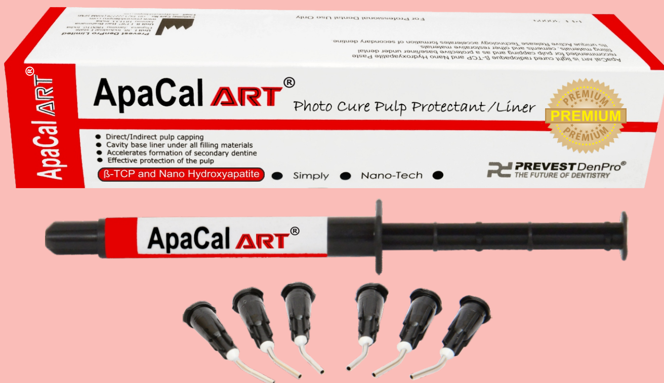
Photo Cure Pulp Protectant /Liner

\beta -TCP and Nano Hydroxyapatite Active Release Technology