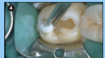
Dry etched tooth surface with clean, dry air / cotton swab.