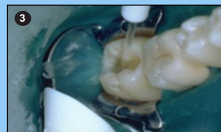
Rinse thoroughly with water spray