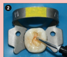
Placement of ApaCal