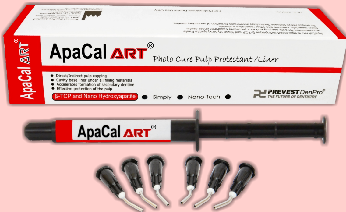
Photo Cure Pulp Protectant /Liner

β-TCP and Nano Hydroxyapatite Active Release Technology