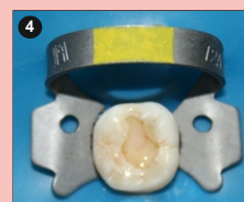
Completed pulp capping