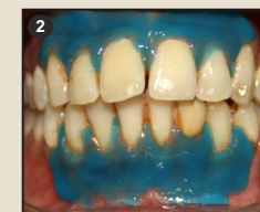
Application of Liquid dam. Light cure for 20 seconds