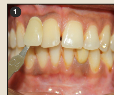
Initial shade determination