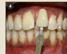
Shade change after 20 minutes of bleaching